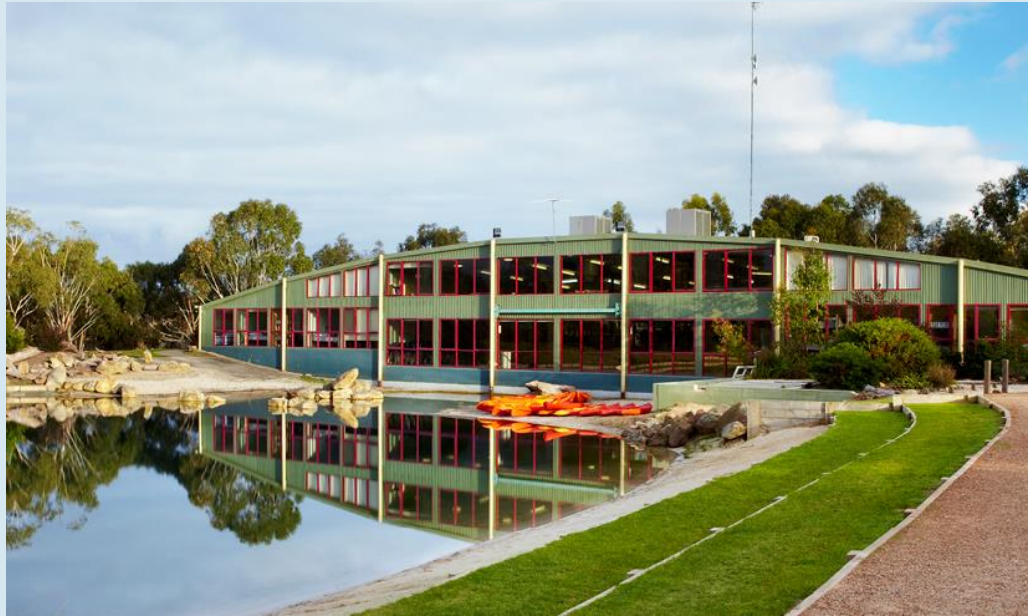
Lake Dewar Discovery Camp 339 Garrards lane, Myrning